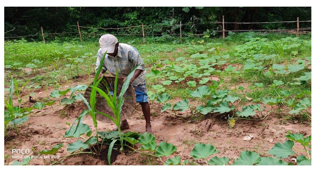
Application of Vermicompost in the field