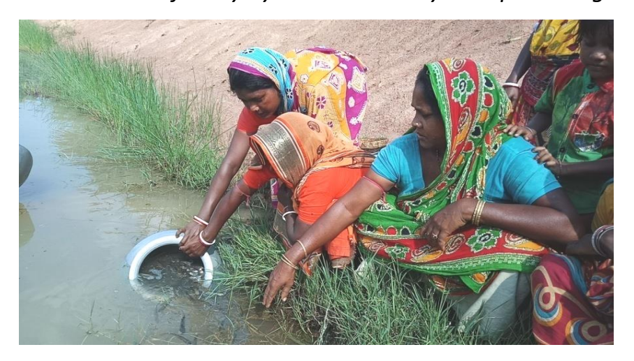
Pisciculture by the women group members at Bankura