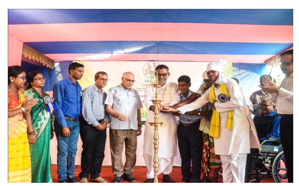
Inauguration of the National Convention

Participants from Bihar, Chhattisgarh, Jharkhand, Madhya Pradesh, Odisha and West Bengal were participated in the national convention and as well as other government functionaries were also present from agriculture, forest. Land, rural development etc. and participants from NGO, local school are also present in the occasion.