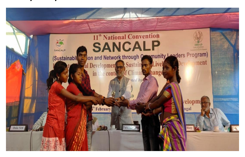
Prize distribution to the participants in the National Convention SANCALP