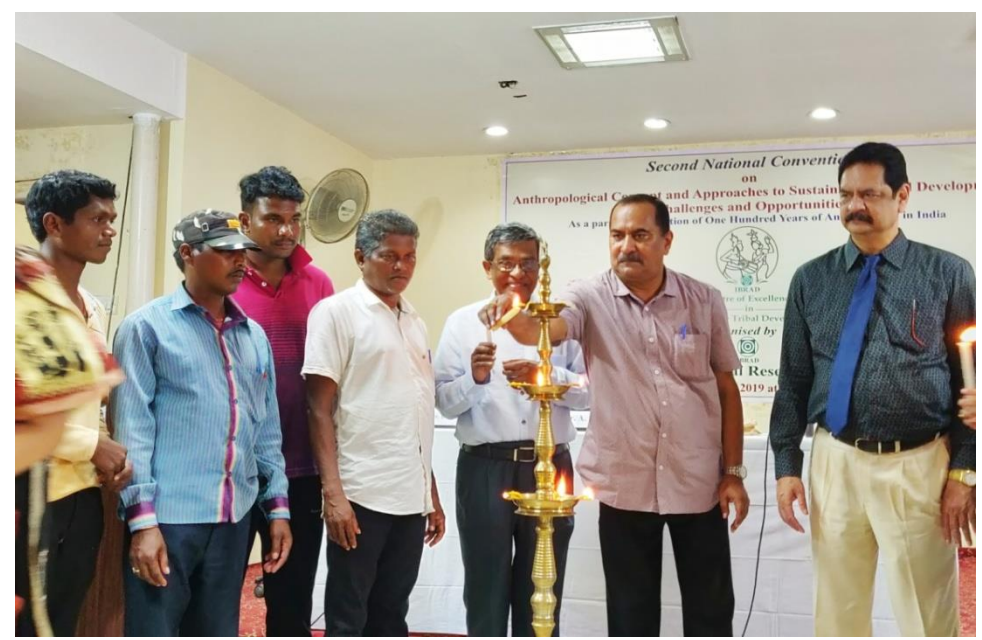
Inauguration of the second National Convention program