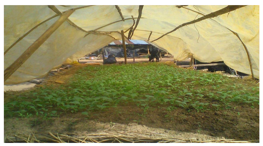
Community vegetable nursery developed by the tribal farmers