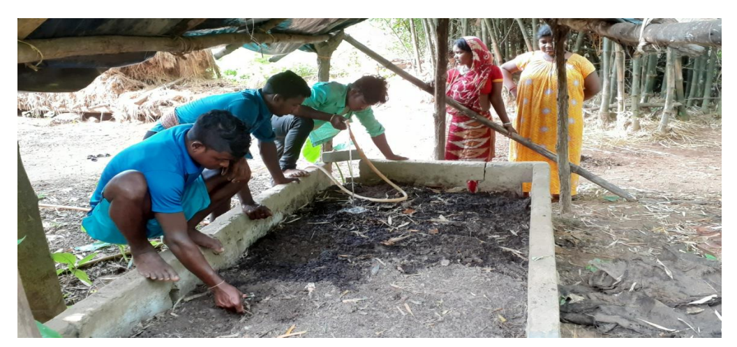
Vermi compost Production by the Lodha PVTG