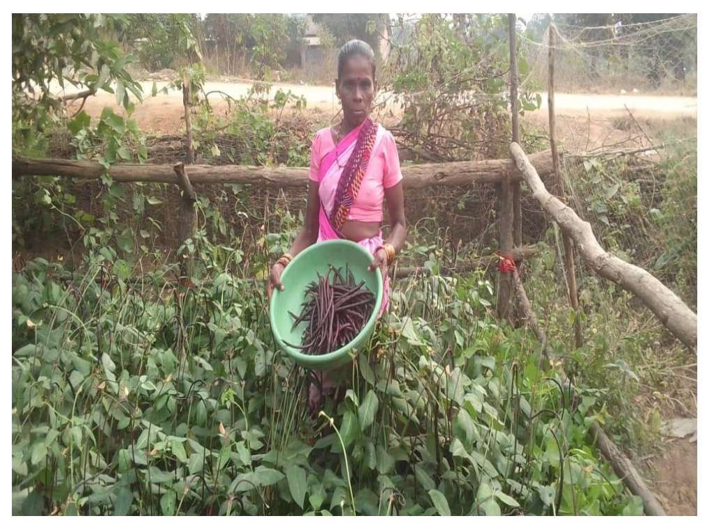
Organic Nutrition Kitchen Garden establishment by Kamar community at Kesodhar village.

Objective - Livelihood development through Organic Nutrition Kitchen Garden, Nursery raising, Vermi compost preparation.