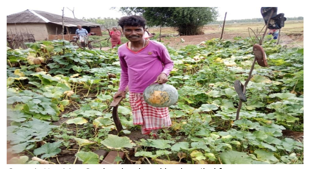
Organic Nutrition Garden developed by the tribal farmers