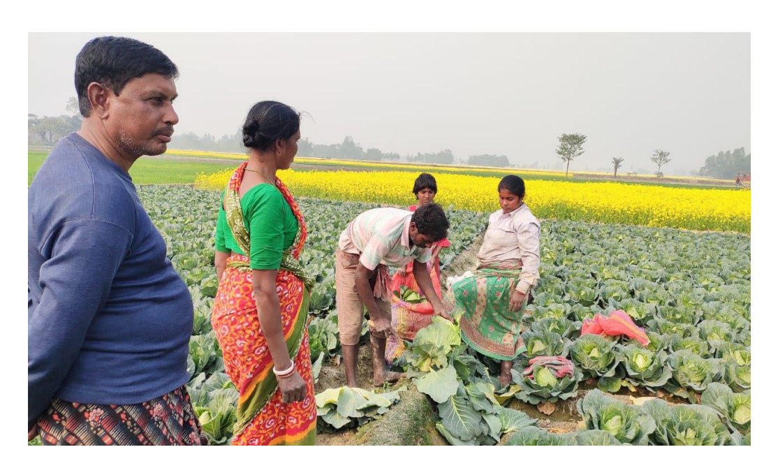
Mixed cultivation by the Water User Association members