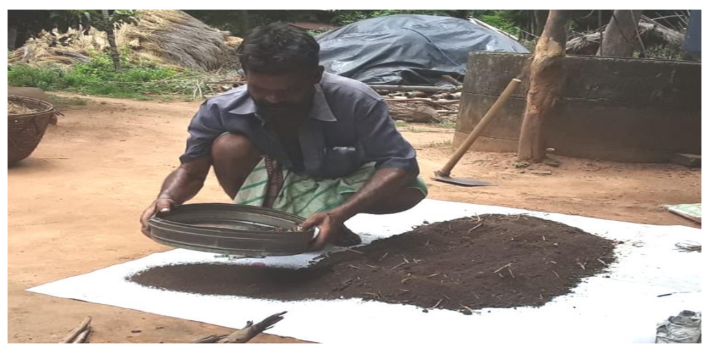
Harvesting of Vermicompost